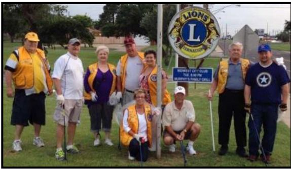
Midwest City LC

OKC Northwest Screened 63 youth, cooked meals for homebound and recycled ink cartridges and cell phones for the service foundation Shawnee, donated money to local public-school teachers for upcoming school year