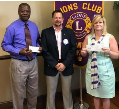
Shawnee LC members